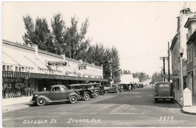
1937. McClung's (1936-1948), Durr's Bar (1936-1943)