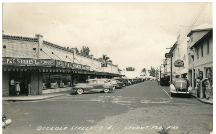
Circa 1948. P&L Stores went into the Osceola Building in 1948 and became H.C. Pence in Dec 1949.

All photos in this newsletter available at tinyurl.com/93884uxu