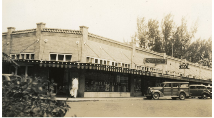
Circa 1937. The A&P (1933-1945), McClung's 5 & 10 (1936-1948), and Durr's Bar (1936-1943).