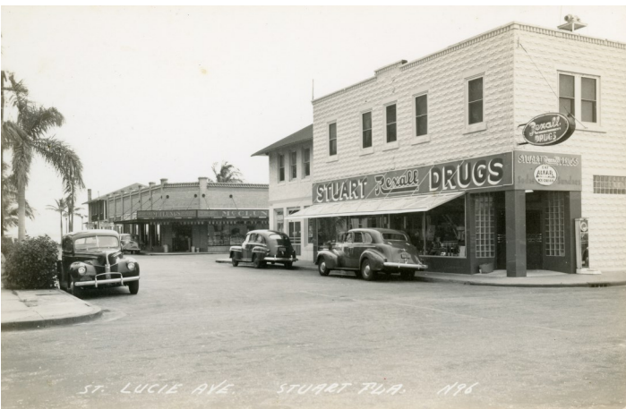
Circa 1947. Corner store is now McClung's 5-10-25 store. Stuart Drugs took over the Feroe Building and installed the Rexall sign in 1947.