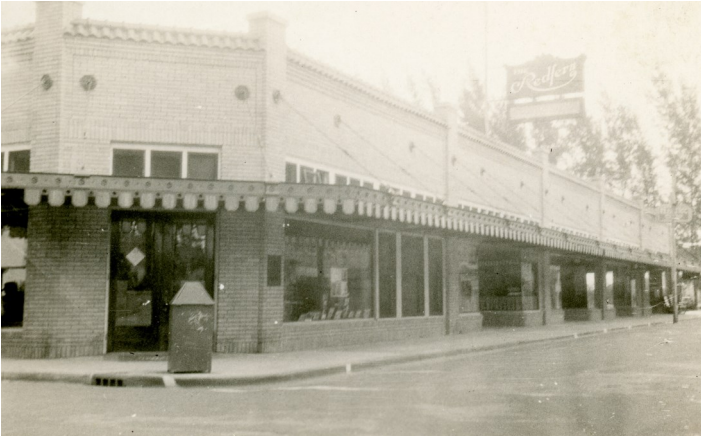
Circa 1926. Redfern Investment and Development Company was granted a license in Oct 1925 and went bankrupt in Nov 1927. While there is no visible sign on the corner store, we know that the Bank of Stuart, originally located across the street, moved to the corner of the Osceola Building in 1921. The bank failed in 1926.