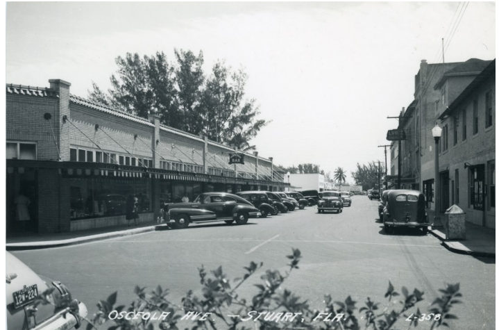
1946. Horseshoe Bar (1943-1950) Date from license plate.